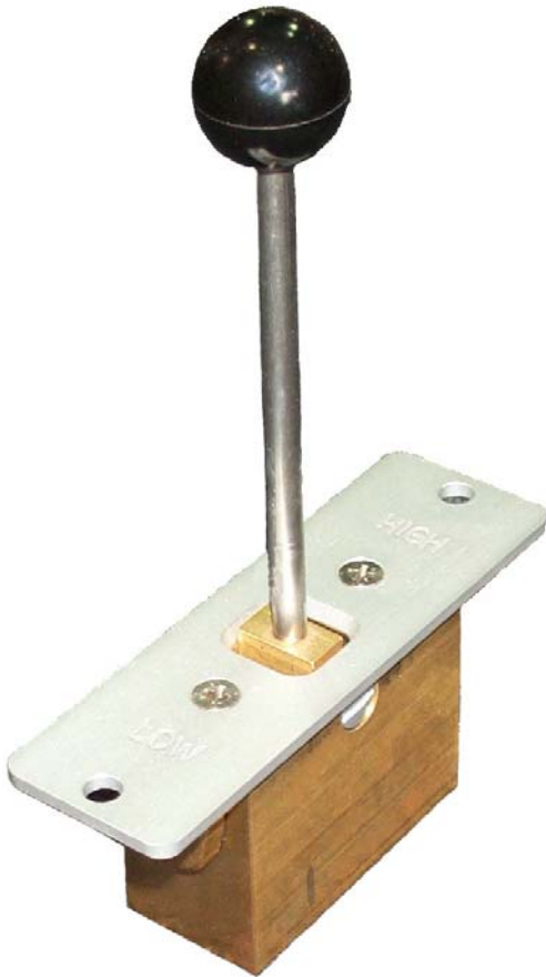
TYPICAL SET UP FOR ILLUSTRATION ONLY